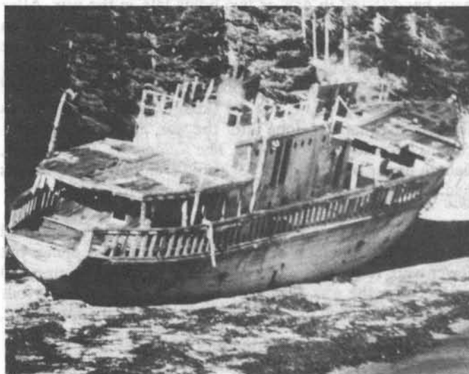
Figure 4. MV Wilcox , ex HMCS Coquitlam , Aground on Anticosti Island, Gulf of St. Lawrence, about 1960.

The main engines also varied depending upon place of build. The two eastern vessels were powered by single Fairbanks-Morse 1941 five cylinder engines capable of developing five hundred BHP and propelling the craft at a speed of ten knots. The eight western ships were powered by single Vivian Engine Works Co. (later Vivian Engine and Munitions Co.) 1943 and 1944 ten-cylinder diesel engines, generating four hundred BHP (or with superchargers giving 625 BHP) at five hundred rpm and capable of speeds of twelve knots. They carried 6,140 gallons of diesel fuel, sufficient for twelve days of 3,500 miles.