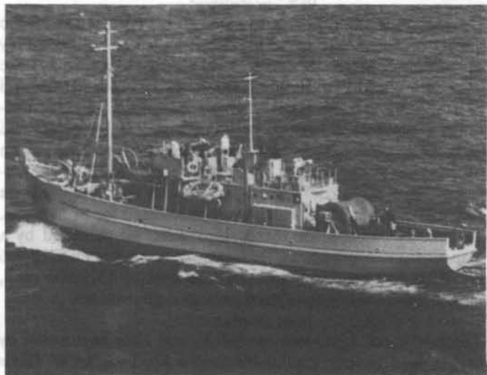
Figure 1. HMCS Llewellyn , off Halifax.

These ships were fitted more austere than the Fairmiles, but reputedly were better seaboats. Naval armament, ships'