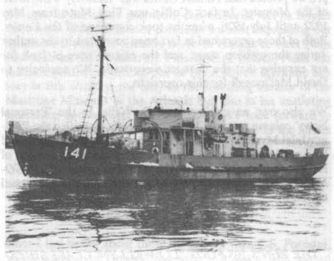
Figure 2. West Coast-Built HMCS St. Joseph , 1945.

Sweeping for magnetic mines usually involved operating in pairs, with one ship designated "master" and the other "slave." Each would trail 525 foot cables from the stern and current was pulsed between the tails from generators carried in the holds in order to trigger the contact needles in the mines. Sweep speed was generally between five and seven knots. While paired sweeping, called "Double L," was more efficient and enabled coverage of a wider area, single ship sweeping was possible in narrow channels or when only one vessel was available. In this case, the current pulsed between the long end of the tail to a shorter, three hundred foot section, via the two fifty-foot long copper electrodes in each tail, with the seawater acting as the conductor. The generators produced one hundred ampere current, stored temporarily in batteries, and the pulse was triggered every thirty seconds. Each pulse lasted four and one-half seconds, in alternate directions, to trigger either north or south sensitive mines.