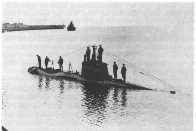
Figure 2: German U-Boat UB-4

As there were small Q-ships so there were small U-boats. For inshore work the Kriegsmarine had built a number of diminutive submarines of only 140 tons dived displacement known as the UB-1 type. These single-screw boats carried two forty-five cm. torpedoes, a single eight mm. machine-gun and a crew of one officer and thirteen men.