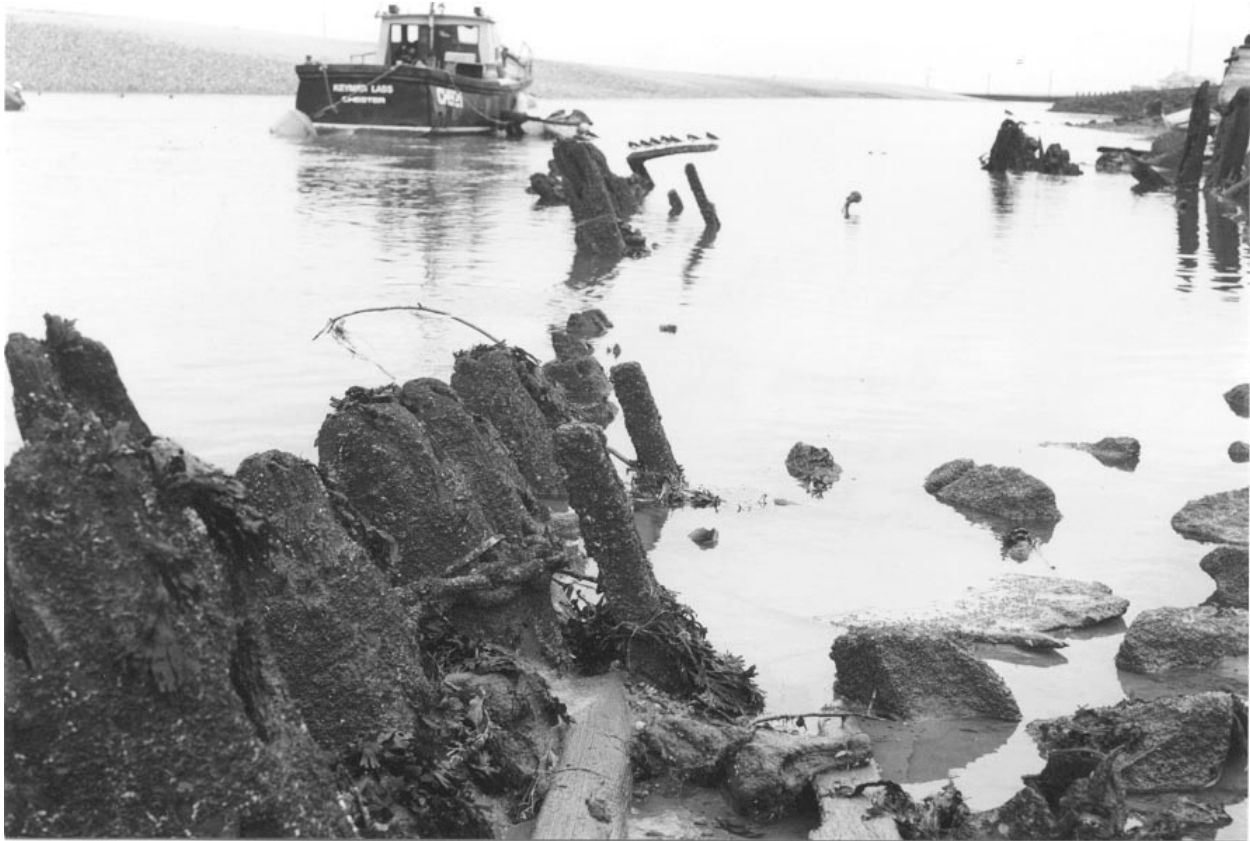
Remains of the City of Ottawa , at Rhyll