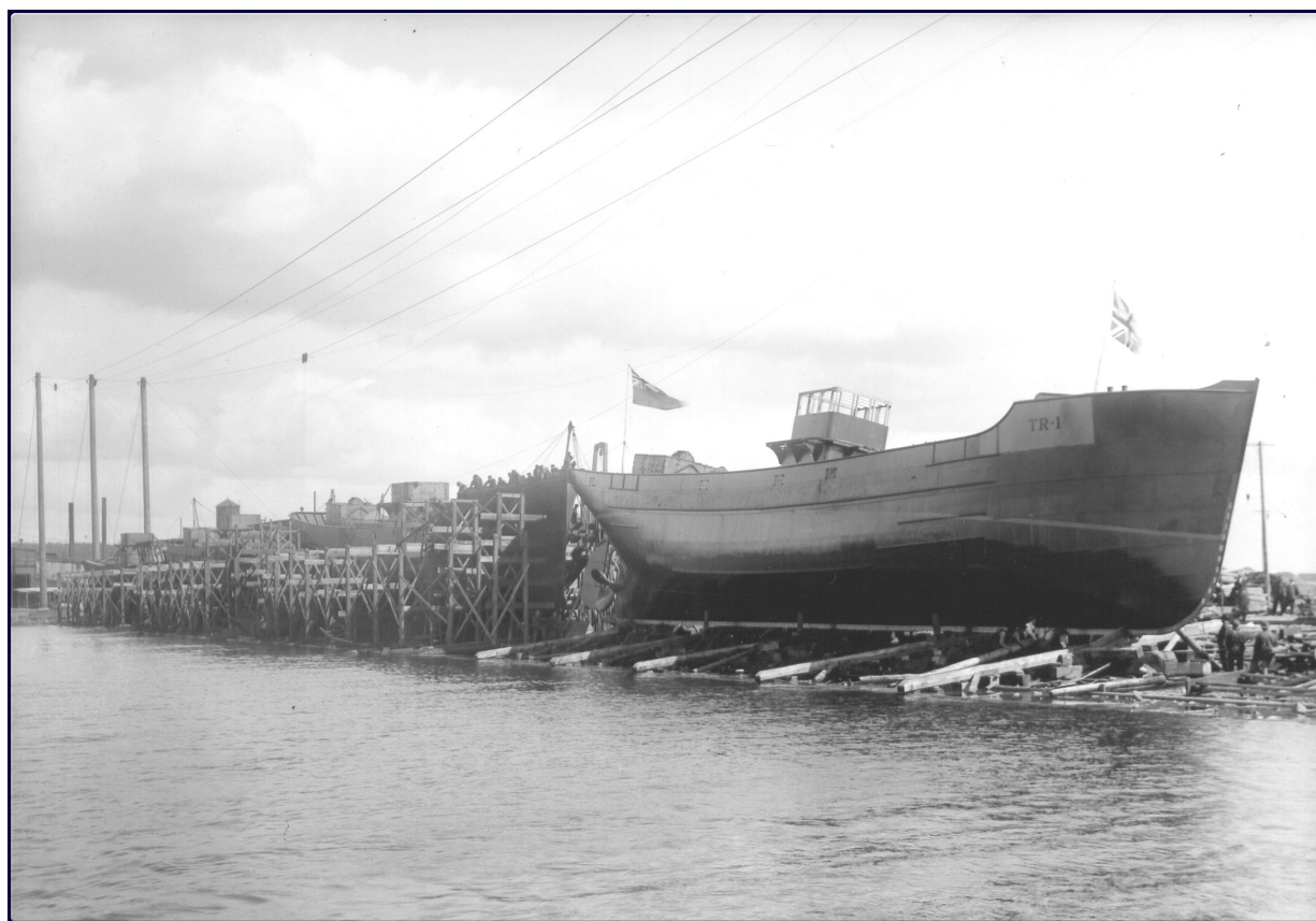
Trawler TR-1 on the ways

then finally diving the wreck and matching her up against the photos and blueprints we had."