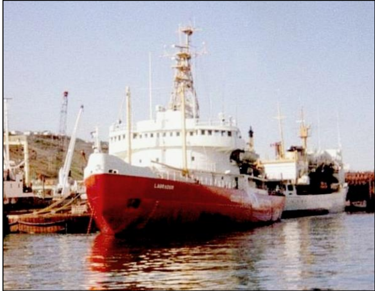
CGS Labrador at St. John's Harbour, June 1982.