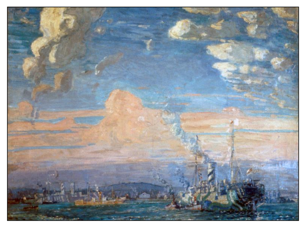
Arthur Lismer, Halifax Harbour - Time of War c. 1917 Oil on canvas, conserved on aluminum 102.5cm × 130cm Collection of the Dalhousie Art Gallery, gift of the artist, 1956