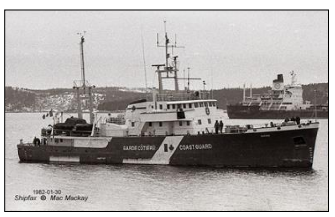
CCGS Daring with the tanker Arhon in the background in Halifax Harbour, January 1982

My service in Daring was well before the Arhon incident and much more hum-drum. Daring was mainly employed in SAR work off the south coast of Nova Scotia. For the most part, it was very routine work and so we were glad to receive orders to go into a historic seaport on the south coast of Nova Scotia, to act as Guard Ship for the annual fisherman's exposition. This exhibition is well known. Thousands of tourists gather for the festivities - scallop shucking, wire splicing, and an exhibition of enormous fish lined up on slabs of