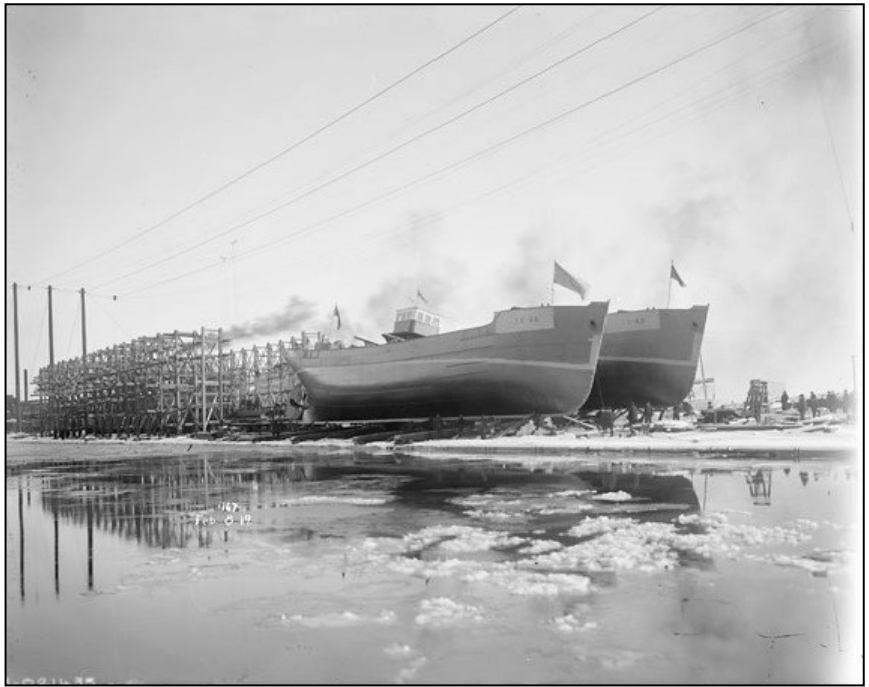
Trawlers TR-43 and TR-44 ready for launching, 8 February 1919.