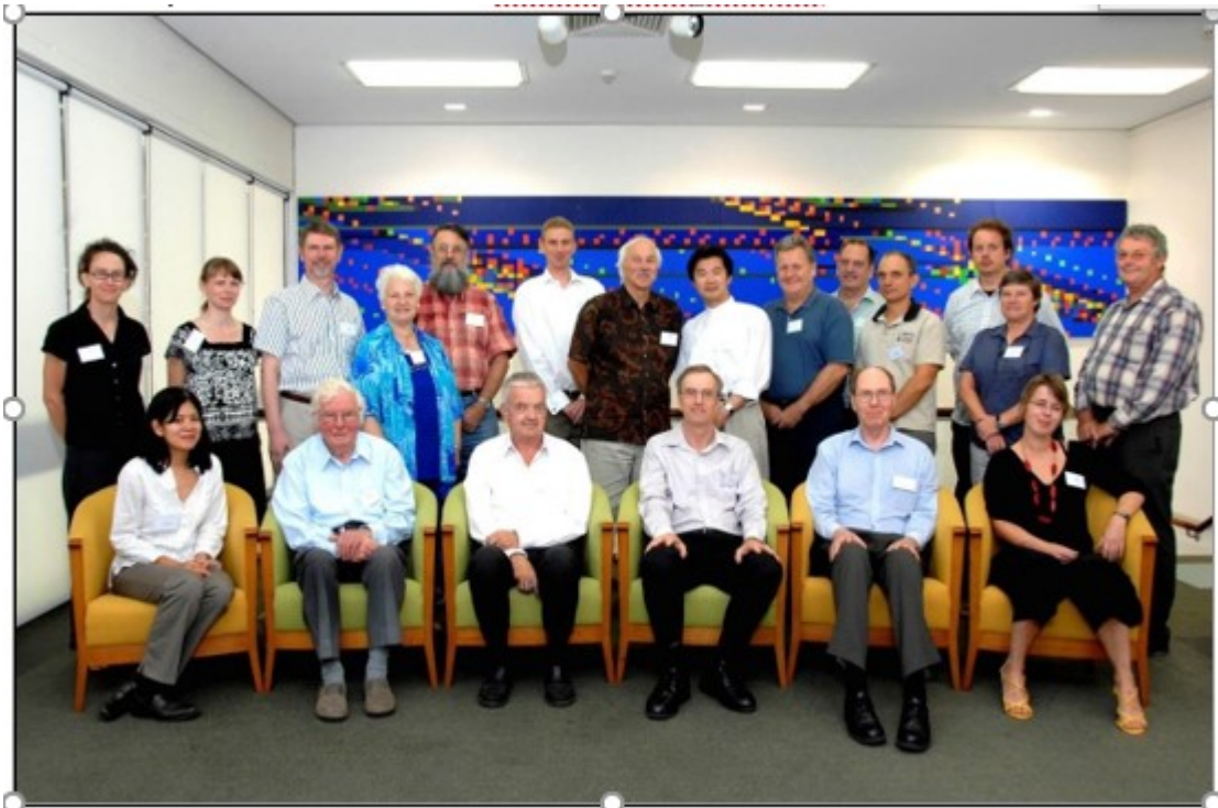
Above: HMAP Asia Workshop, Murdoch University (11 February 2009). Right: Historical Perspectives of Fisheries Exploitation in the Indo-Pacific (2014).