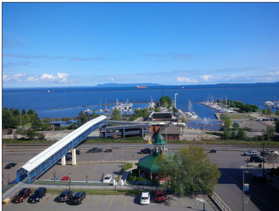
View of Thunder Bay from the Prince Arthur Waterfront Hotel, 23 August 2019