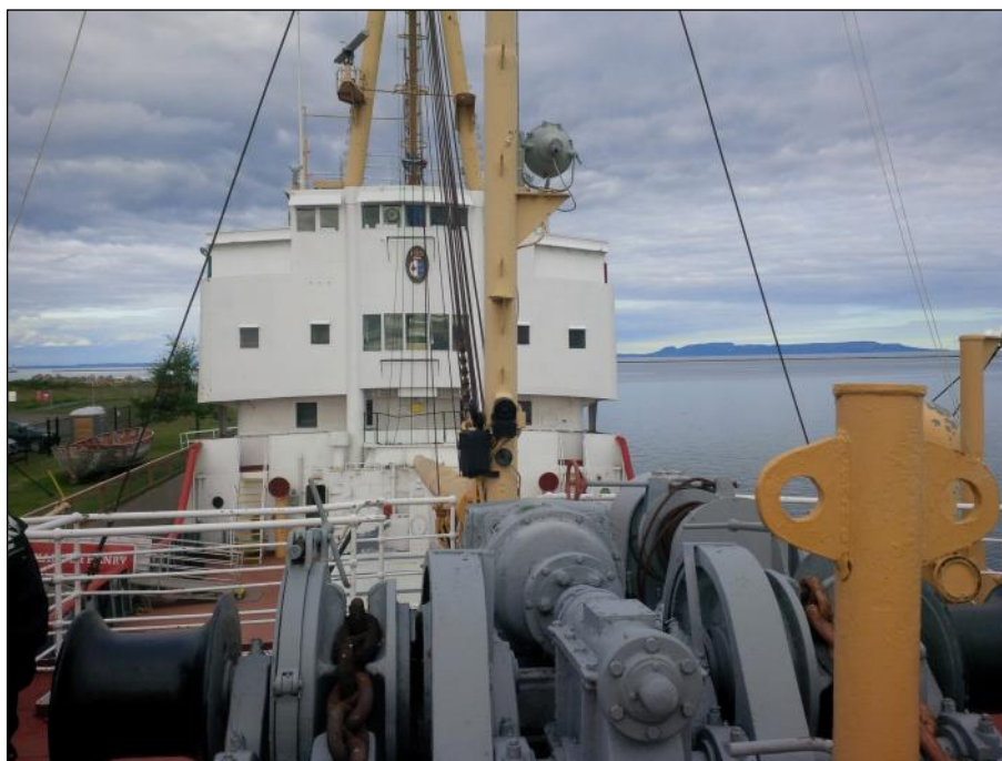
CCGS Alexander Henry with the Sleeping Giant in the background, 22 August 2019