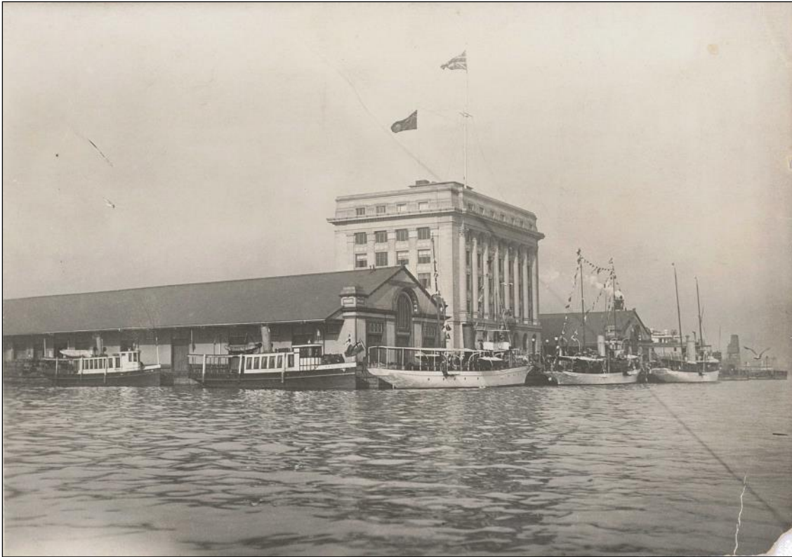
PortsToronto's landmark building on the water's edge, 22 September 1920.

The Archives Association of Ontario announced that PortsToronto has won the Corporate Award during the AAO's virtual annual meeting on 25 June 2020. The Corporate Award is given by the AAO to organizations, corporations, or agencies of any kind that have been particularly supportive of archives and/or the archival community.