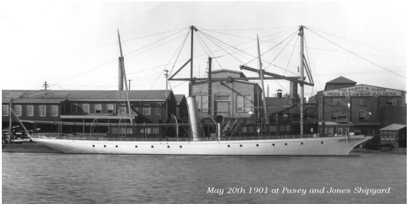
May 20th 1901 at Pusey and Jones Shipyard

Cangarda is a unique survivor of the glorious age of steam.