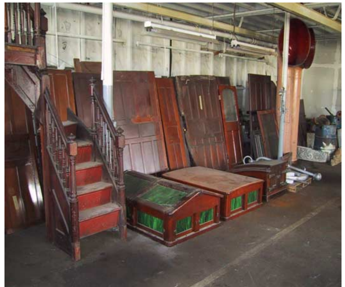
Cuban Mahogany paneled interior, deck structures with Tiffany glass and all fittings ready to re install.

Offered exclusively by the restoration experts at J-Class Management