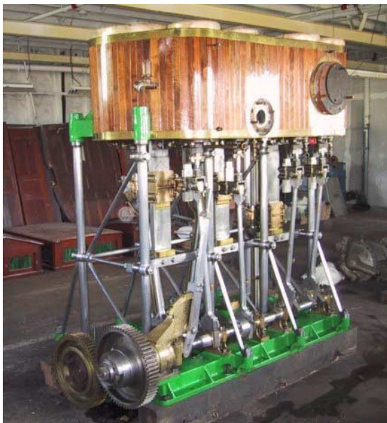
The original J.W. Sullivan steam engine with varnished lagging, polished brass and steel.

Her extraordinary state of originality and preservation make her one of the best restoration opportunities in the world. The original steam engines have been fully restored by the Kew Bridge Steam Museum in London. The Cuban mahogany deck houses and interior are complete and in excellent condition. The hull, engines, interior and deck joinery are ready for inspection.