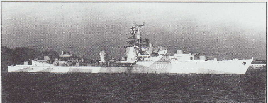
Athabaskan at anchor in Plymouth harbour.