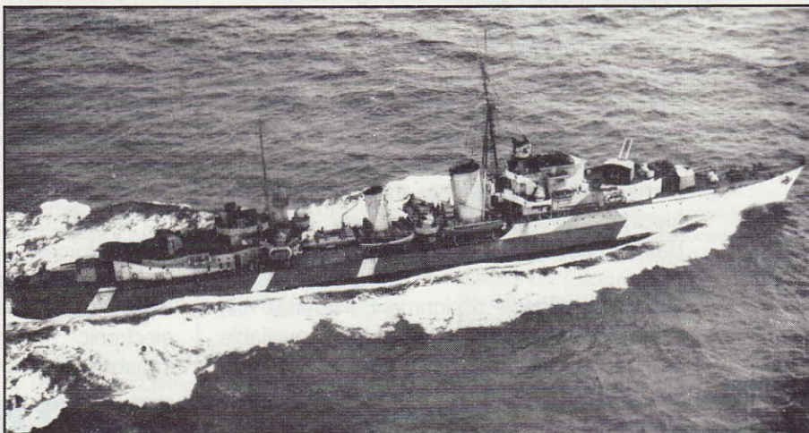
Haida at speed in the Channel, June 1944.

Although valuable lessons had been learned, the severe shortage of destroyers