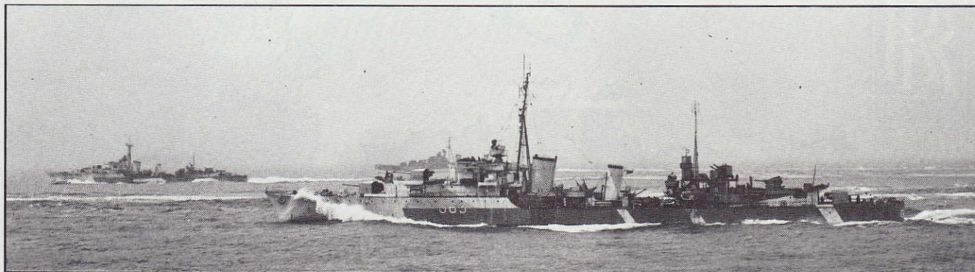
Haida , Tartar and an improved Dido-class cruiser (likely Black Prince ) practising high-speed manoeuvres, Spring 1944.

While Force 26 was carrying out its sweep, three MTB's — Force 114 — were to lie beyond the eastern end of the patrol line in order "to detect and report enemy surface forces on passage." To ensure that Force 114 did not frighten contacts away from the main strike force, the MTB's were under orders not to attack any shipping