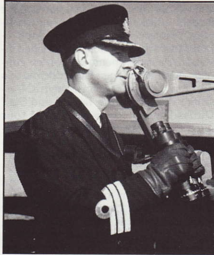
Commander H.G. DeWolf on Haida's bridge.

The torpedo that hit Athabaskan at 0417 caused such damage that it was impossible for the crew to save their ship. According to the accounts of survivors the torpedo exploded in the gearing room located in the hull abaft the engine room. The main fuel bunkers lay astern of the gearing room, and behind them the 4-inch magazine: this arrangement proved fatal. Stuart Kettles recalled that a "diesel oil fire breaks (sic) out at the tubes, enveloping entire after canopy and stern. Flames forty to fifty feet high. Pompom ammunition explodes in all directions." 44 Because the aft 70-ton pump had been disabled, the fire spread