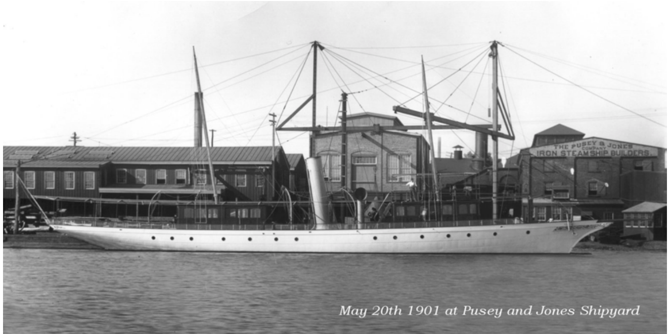
May 20th 1901 at Pusey and Jones Shipyard

Cangarda is a unique survivor of the glorious age of steam.