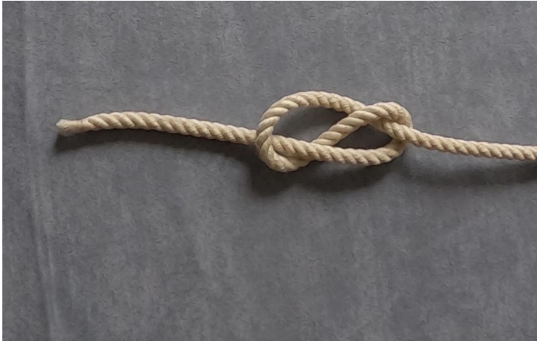
Figure 8 Knot How to